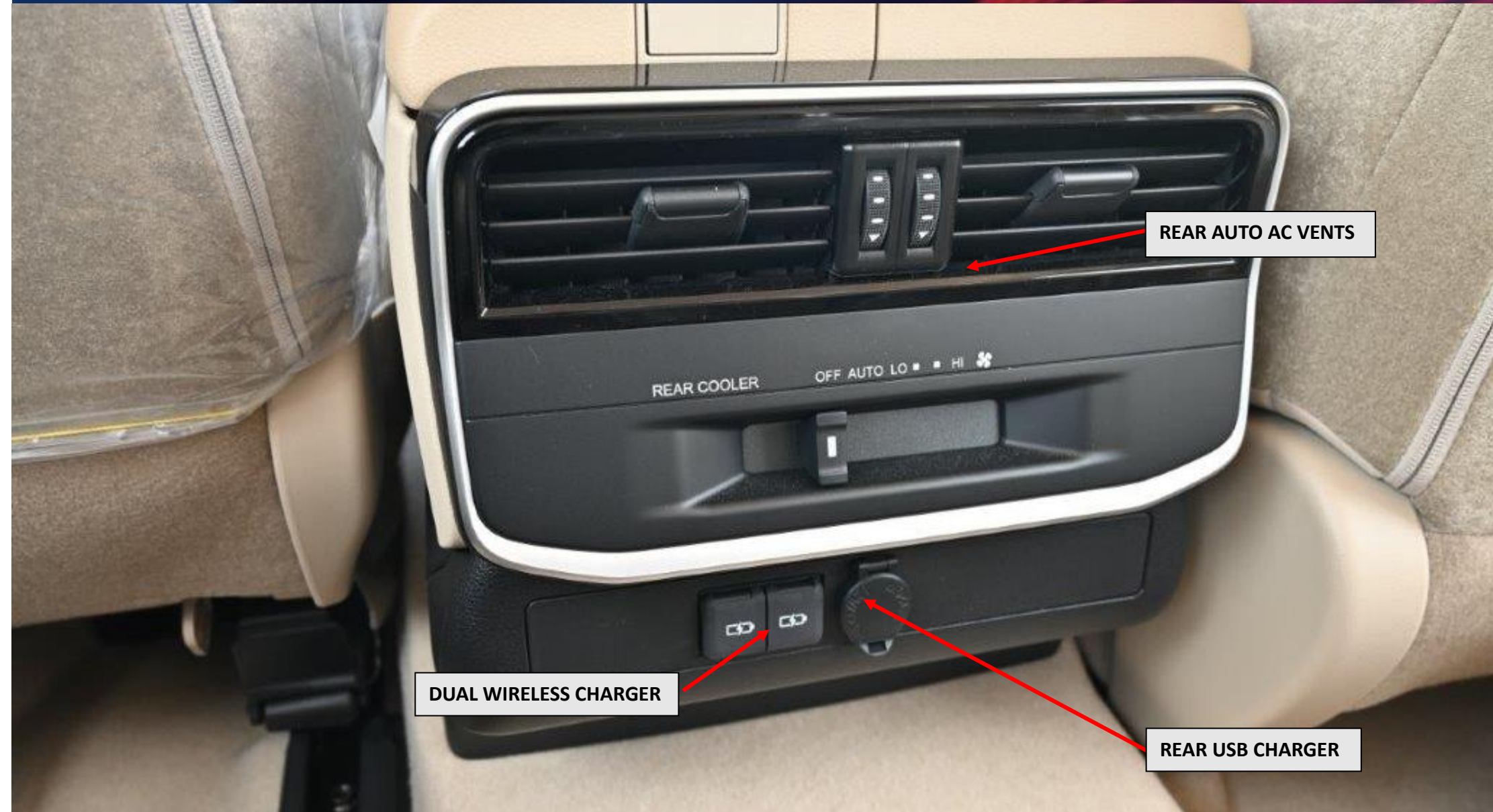
REAR AUTO AC VENTS