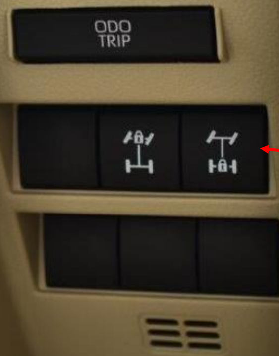
DIFF LOCK OPTIONS