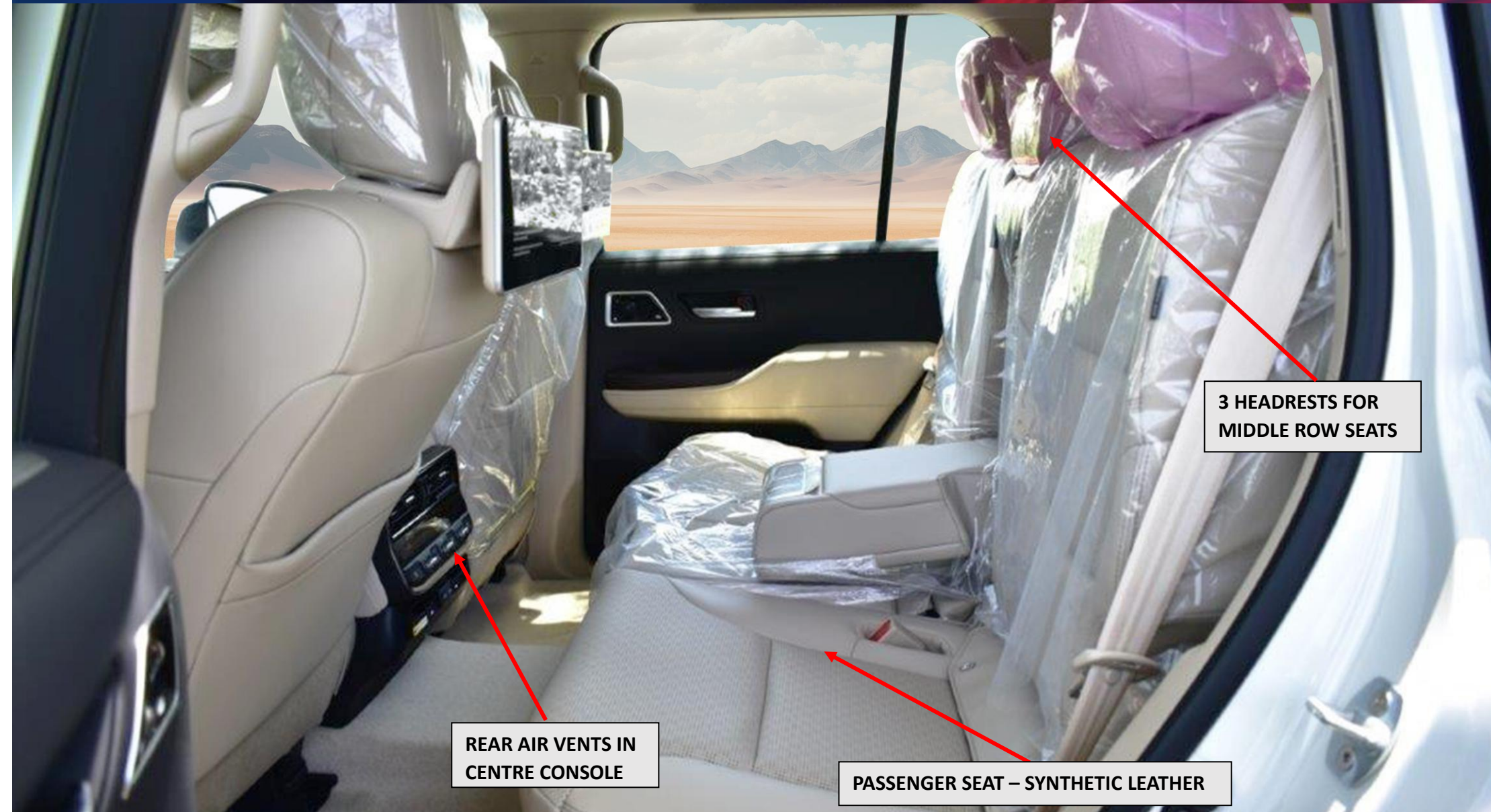
REAR AIR VENTS IN CENTRE CONSOLE